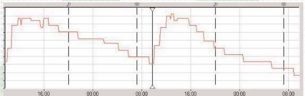
Graph showing the fluctuations in slab weight over a two-day period.

Please contact HortiMaX +31 (0)15 362 03 00 or one of our dealers in your area. You can also visit our website at www.hortimax.com .